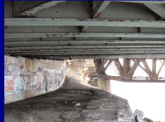
Rt. 1 bridge underpass