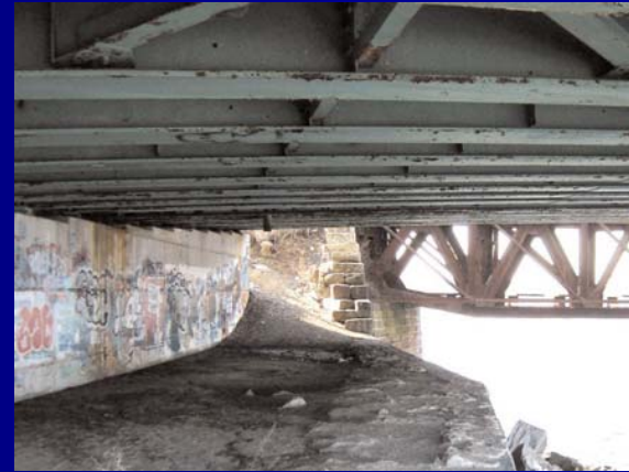
Rt. 1 bridge underpass