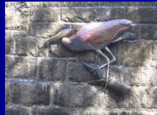
"Great Blue Heron" by Bob Kimball