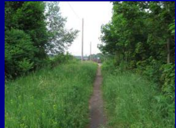
North to Merrimack River