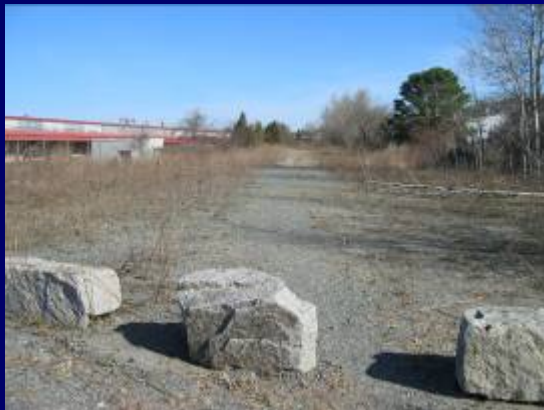
North of train station