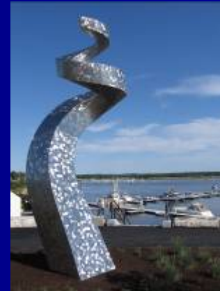
"G-Swirl" by Dale Rogers