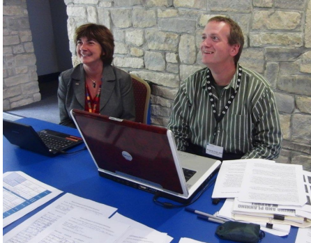
NNECAPA Ethics Gurus...