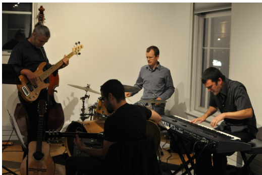
Thursday Night Entertainment... yes we got some dancers out of that!